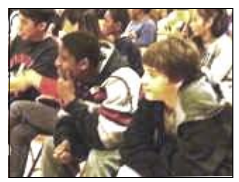
Children eagerly wait for their gifts

out their help shopping for the families and children would