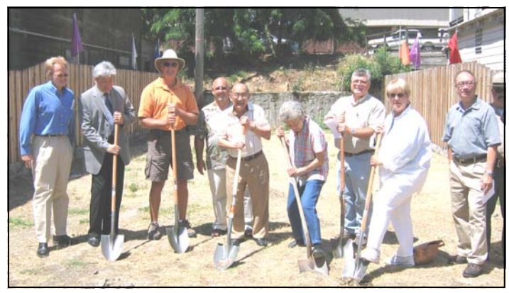
Townspeople and officials are breaking ground for the new park on Locke's main street

history the LF also provided guidance regarding architectural standards and to raise funds to support historical and cultural projects. The LF is a non-profit organization with a 501(c)3 classification.