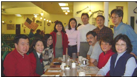
Volunteers Gather for a Thank You Breakfast