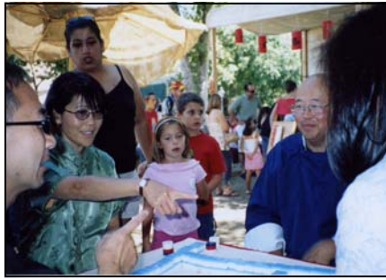
Friends of Charlie Chan's Majong group Demonstrate this popular Chinese game