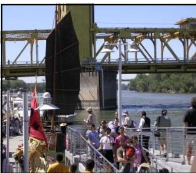
Crowds view the Grace Quan at the dock during Gold Rush Days