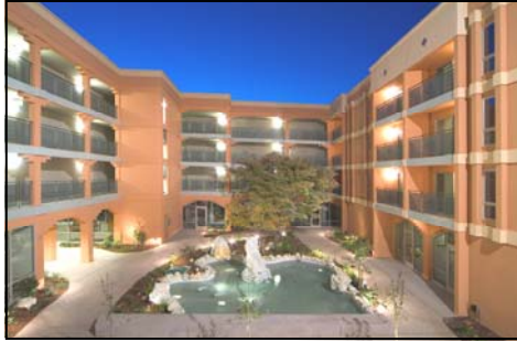
Renovated Ping Yuen Housing

CACS has been instrumental in advocating for Ping Yuen and its tenants as early as 1996 when the building was falling in disrepair. The building was vacated in 1997 when tenants were relocated to other public housing units.